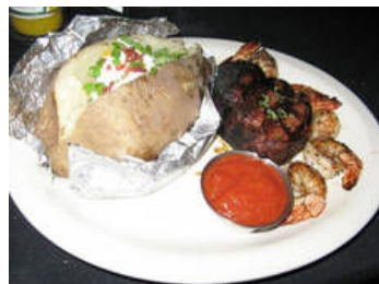
The surf and turf with a loaded baked potato.